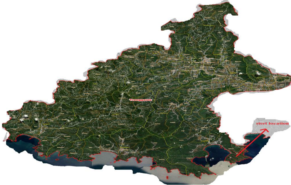
Fig 1. Map Location Reset In Trenggalek

This research was conducted in Trenggalek Regency, East Java Province. This research was conducted from May to September 2021. The materials used were soil maps, topographic maps, demographic data, rainfall data, and chemicals for soil analysis in the laboratory. The tools used are survey equipment, soil drill, sample ring, knife, compass for directions, writing tools, work map, Global Positioning System (GPS), Global Information System (GIS) software, and digital camera.