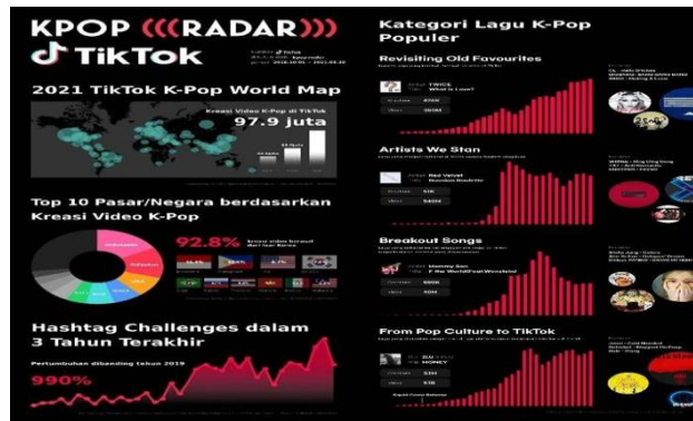
Fig. 1 Infographic 2021 Kpop Tiktok