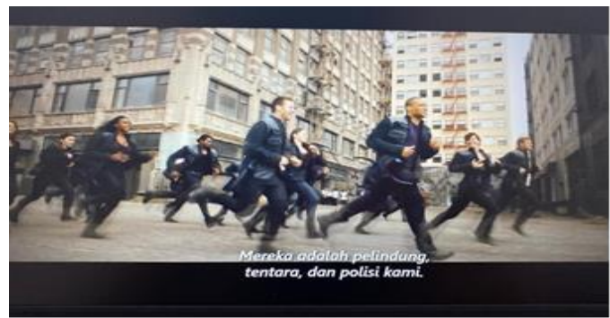
Pict. 3 & 4. Dauntless faction’s symbol (blazing flame), their costume, and their role in society.