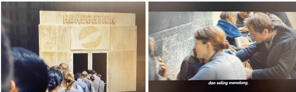
Pict. 1&2. Abnegation faction’s symbol (two hands clasped together), their costume, and their role in society.

In the film, the Abnegation symbol is further reinforced by the dominant use of gray in their clothing and living environments. These simple, unobtrusive colors underscore the symbol’s meaning as a representation of a humble life—one that does not seek the spotlight and distances itself from selfishness. Additionally, the gesture of interlocking hands symbolizes solidarity, social compassion, and dedication to others.