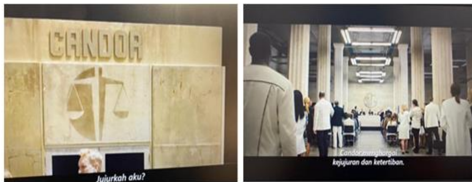
Pict. 9. Candor faction's symbol (a set of scales in a state of balance), their costume, and their role in society.

In the film, the scales symbol is further reinforced through the use of black and white in the Candor members' attire, symbolizing the clarity between right and wrong. Candor members are depicted as speaking directly, openly, and without hiding the truth, even though this sometimes leads to conflict. Additionally, the Candor faction is associated with the role of law enforcers or those tasked with determining the truth, further emphasizing the meaning of justice and objectivity they uphold.