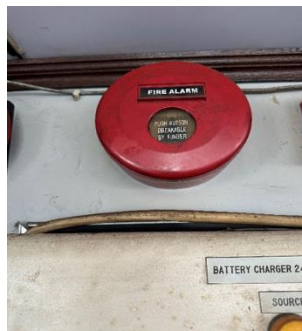
Fig. 4 Fire Alarm

The KMP Trisna Dwitya fire alarm panel is integrated with a smoke detector, alarm bell, and manual call point, displaying active voltage/current indicators for centralized control in accordance with PM 12/2022 (Ministry of Transportation of the Republic of Indonesia, 2022). This system processes real-time smoke signals from critical zones, triggering instant crew alerts (Branch, 2021).