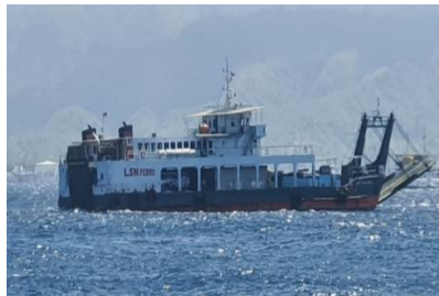
Fig.1. KMP. Trisna Dwitya Ship

KMP. Trisna Dwitya is a Ro-Ro passenger ship owned by PT. Lintas Sarana Nusantara, operating on the Ketapang-Gilimanuk route with a GT of 150-400, fulfilling PM 12/2022 for smoke detectors in critical areas (Ministry of Transportation of the Republic of Indonesia, 2022). This ship is equipped with standard safety facilities for passengers and cargo, crucial for preventing fires in vulnerable waters such as the Bali Strait (BPS, 2026). The research was conducted during the researcher's sea practice (July 2024-July 2025), focusing on the smoke detector system and maintenance (Sugiyono, 2023).