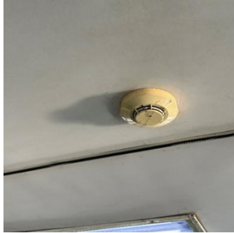
Fig. 2 Smoke Detector

Based on the observations made, several findings were obtained regarding the operation of smoke detector systems on ships. These findings are presented in the following points to provide a more detailed overview of conditions in the field: