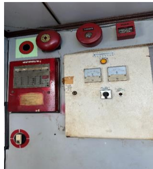
Fig. 3 Fire Alarm Panel

The placement of smoke detectors on KMP Trisna Dwitya follows the ship's fire plan with strategic precision, installed in navigation rooms, accommodations, and corridors as the main evacuation routes and high-activity zones prone to fire, as mandated by PM 12/2022 for ships with a gross tonnage of 150–400 (Ministry of Transportation of the Republic of Indonesia, 2022). The ceiling position maximizes the detection of naturally rising smoke, aligning with Stopford (2019) and Branch (2021) maritime standards for sensor optimization in enclosed areas. Field observations confirmed compliance with the fire plan's zone division, ensuring an integrated response despite the vulnerability to tropical factors such as humidity (Kim & Roh, 2024).