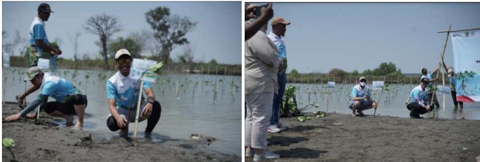
Fig 3. Planting activities by PT Pertamina Patraniaga Fuel Terminal Cikampek

Mangrove planting activities with Avicennia marina species were carried out as many as 7,777 seedlings. The mangrove planting program by PT Pertamina Cikampek does not only involve external parties from Sedari Village, but also involves community participation. Approximately 20 people are involved in the mangrove planting program. Community participation is one of the important elements in the implementation of empowerment programs so as to increase public awareness of the environment. Planting activities cannot be separated from the abrasion condition of Sedari Village which is getting worse. Now the distance between settlements and the shoreline in Sedari Village is only about 20 meters, according to information from key informants interviewed, the distance between the shoreline and settlements is quite far. In line with this, the information obtained from [9] mentions that the description of the distance between settlements and the shoreline states that people still pass through the plantation area to the mangrove forest first. In line with this, mangrove planting activities have a high level of urgency for areas affected by abrasion. areas with large and dense mangrove areas have lower abrasion values[10].