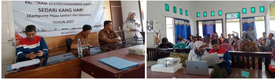
Fig 2. Tree Foster Parents Training

In general, both planting and OTAP activities are within the framework of the big theme SEDARI KANG HARI which has the meaning of Sedari Village as a sustainable and independent green village. The big theme is inseparable from the condition of Sedari Village which requires efforts to deal with the risk of abrasion and the continued impact of the climate crisis[7][8].