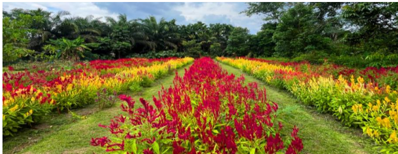
Fig 3. Taman Bunga Impian Okura

The main attraction is the collection of tropical and ornamental flowers. The colors, shapes, and arrangements of the flowers are a major draw for visitors. There's also a dovecote, adding to the cheerfulness and natural beauty of this destination. As seen in the following image: