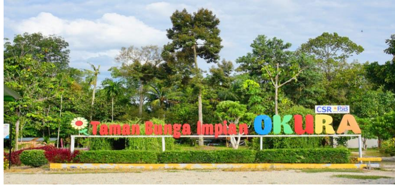
Fig 2. Taman Bunga Impian Okura

Located in the Rumbai Timur District, Taman Bunga Impian Okura has become an increasingly popular tourist destination, offering natural scenic beauty complemented by diverse floral collections that attract nature lovers and photography enthusiasts. Its strategic position along the banks of the Siak River provides visitors with impressive panoramic views, where the river's flowing currents form a distinctive natural landscape. Although situated on the outskirts of the city, Taman Bunga Impian Okura remains easily accessible by private transportation. The site is managed collaboratively by local youth and the Tourism Awareness Group (Pokdarwis), reflecting strong community involvement in the development of local tourism.