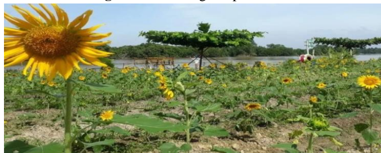
Fig. 4. Taman Bunga Impian Okura