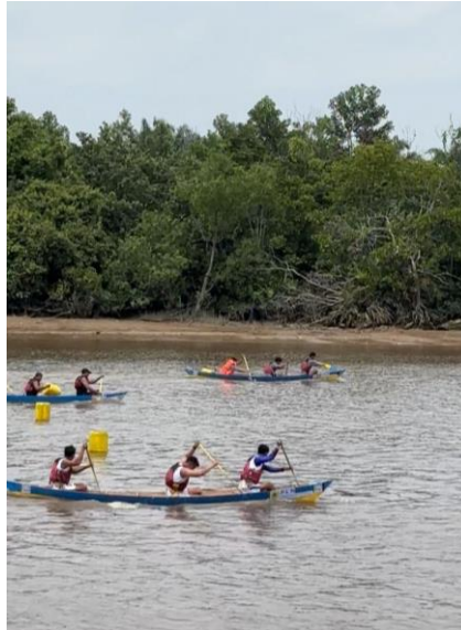
Fig 6. Pacu Sampan

The results of interviews conducted with the Pekanbaru City Tourism Office provided guidance, motivation, and training for several young people so that tourists would feel protected if a disaster occurred with their boats. The tourism office also provided support by finding sponsors who wanted to participate in cultivating the culture that sampan racing has the potential to develop Malay culture that is rarely used by young people. With the event being held twice in Okura, many people are interested in participating in the competition and the number of visitors has also increased, even though the hot tropical climate remains enthusiastic visitors enjoy the event held.