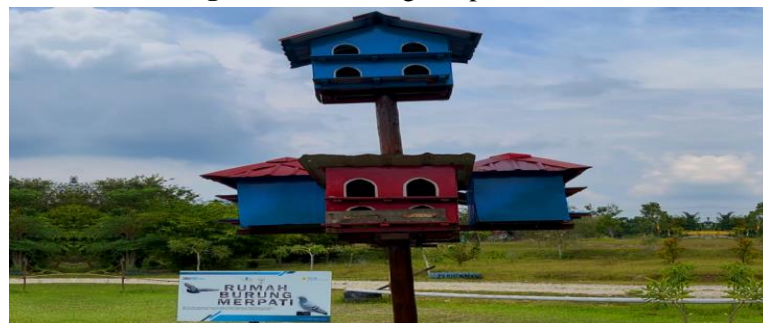
Fig 5. Taman Bunga Impian Okura